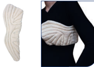
Serratus Anterior Pad