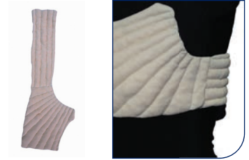
Chest-wall Pocket Pad