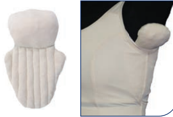
Mini Axilla Pad