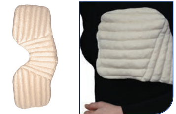
Unilateral Post-Mastectomy Pad