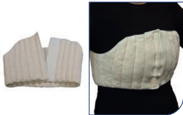
Double Mastectomy Pad